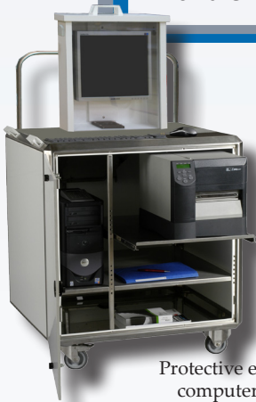
Protective enclosure with computer hardware