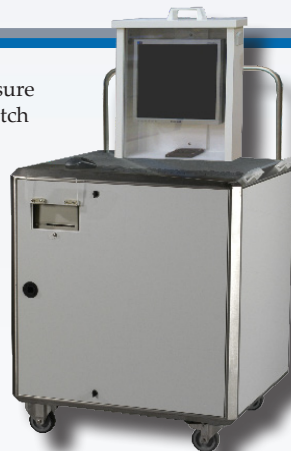
Protective enclosure with TAV L24 hatch