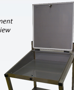
Compartment interior view