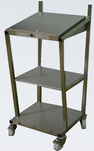
Stainless Steel and wheels model + compartment

Available in STEEL or tailor-made dimensions