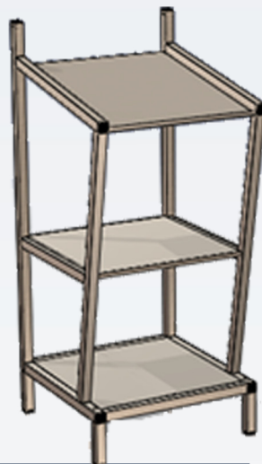
Stainless steel and legs model