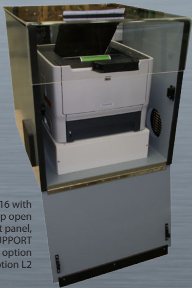
IL 16 with drop-down flap open on front panel, PRINTER SUPPORT option and Option L2