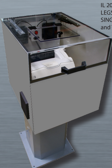
IL 20 with LEGS option SINGLE UNIT and TAV LASER