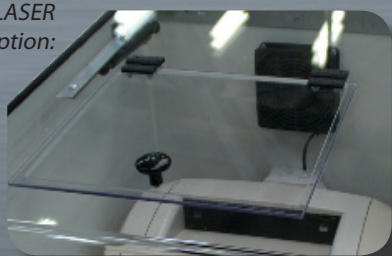
TAV LASER option: