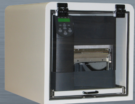
CIT L GM