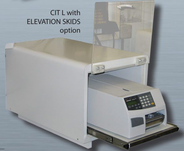
CIT L with ELEVATION SKIDS option