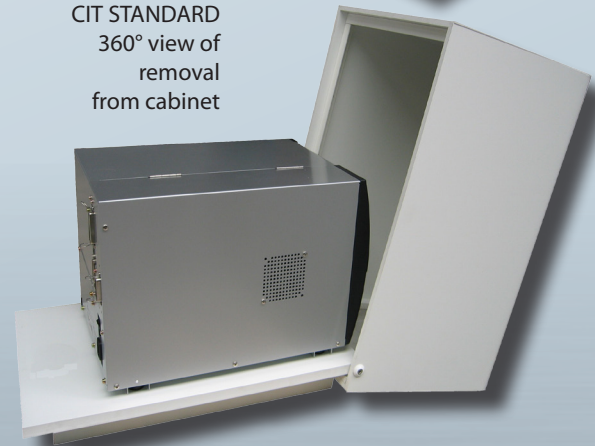
CIT STANDARD 360° view of removal from cabinet