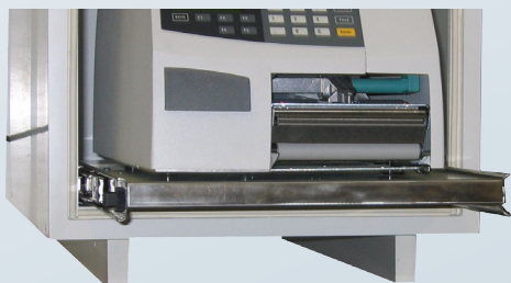
ELEVATION SKIDS option